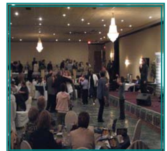
A good time was had by all!!!